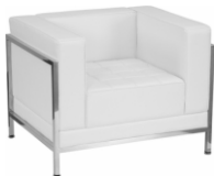
SORRENTO CHAIR WHITE