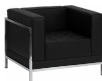
SORRENTO CHAIR BLACK