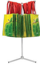
Tote Bag Holder

Looking for an item you do not see? Please call our office for availability and pricing.