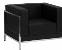
SORRENTO CHAIR BLACK