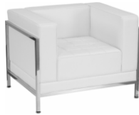
SORRENTO CHAIR WHITE